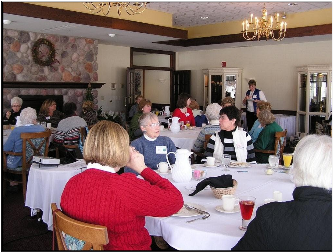
League of Women Voters of the La Crosse Area and AAUW members join together for a program on Pay Equity on January 10, 2009.

Legislative information from the Library of Congress: